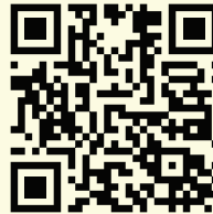
Black Panther and Afrofuturism

AFROFUTURISM- A movement in literature, music, art, and pop culture that features futuristic or science fiction themes that incorporate elements of Black history and culture.